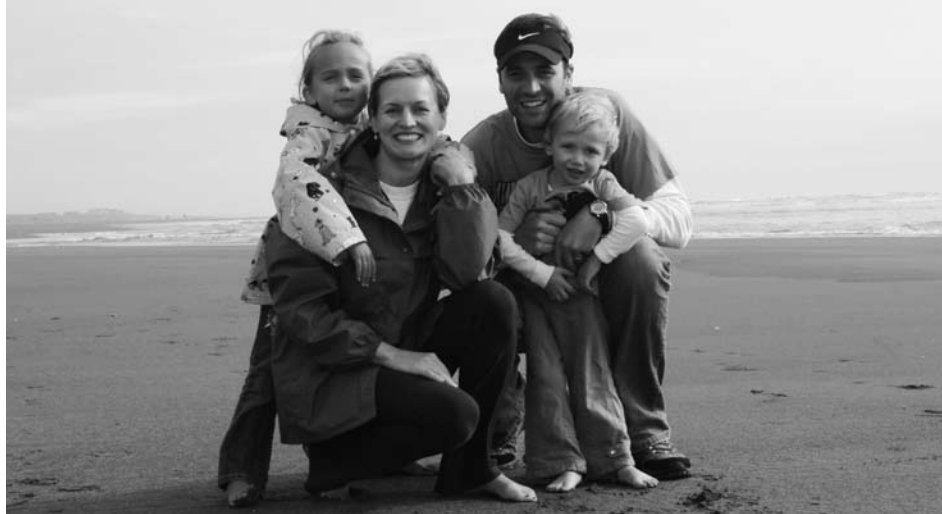
Family Voices is a Listen and Talk group of parents who actively support the school.

That requires giving back to Listen and Talk and remembering where we all started. I hope to hold on to these thoughts and hold them dear to us as we continue to move through the many new chapters ahead.